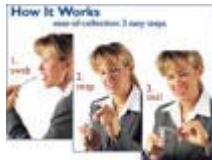
Unexpected Benefits from Oral Drug Testing

We've talked for years how the D's who so naturally start up companies need to compensate for their weaknesses ASAP if they are to continue to run them. That balance of the C - the diplomacy, rules & procedures are "the brakes" that become increasingly necessary.