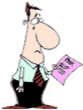
The Apprentice More Fun Viewed in DISC

All winning responses will get: One free Golf Stroke-Saver Behavioral Insights Analysis Report!